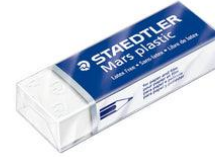
2 white Staedtler erasers