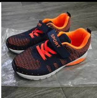
Non-slip inside shoes (NO LACES)