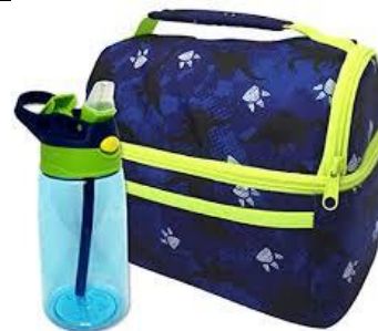
Water bottle and lunch kit