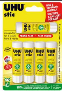
4 LARGE glue sticks

Additional supplies may be required throughout the year.