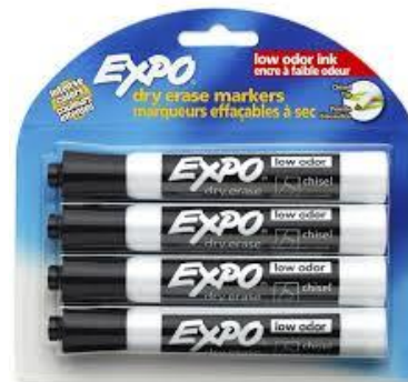
4 black dry erase markers

Donations of Play-Doh for the classroom to use in literacy, math, and play centres. Please see teacher for the recipe if you wish to make it.