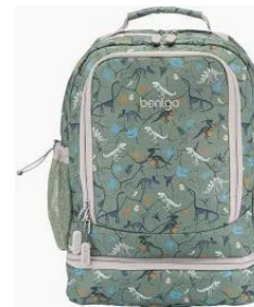
1 backpack large enough to hold lunch, snack, water bottle, library book, and crafts